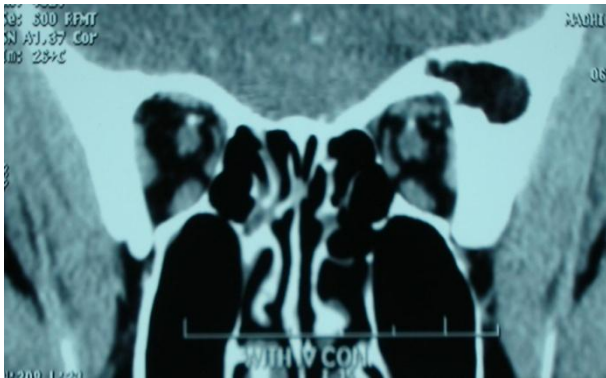
Figure 1. Orbital CT-scan (coronal view)

The computed tomography (CT-Scan) of the orbit was done and revealed a well demarcated cystic lesion within the orbital roof. This lesion involved the frontal bone and extending to the greater wing of the sphenoid bone with a stalk extending down to the orbital cavity through a well-defined bony defect in the orbital roof (Figures 1, 2).