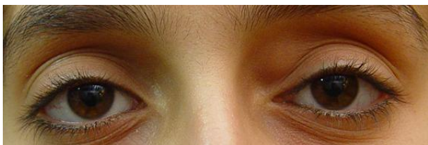
Figure 1. A 15-year-old girl with a mass in superonasal quadrant of the left orbit

Results of histopathologic evaluation confirmed the diagnosis of a dermoid cyst. The cyst filled with keratin and lined by stratified squamous epithelium. Hair follicles and adipose tissue are found within the cyst wall (Figure 5).