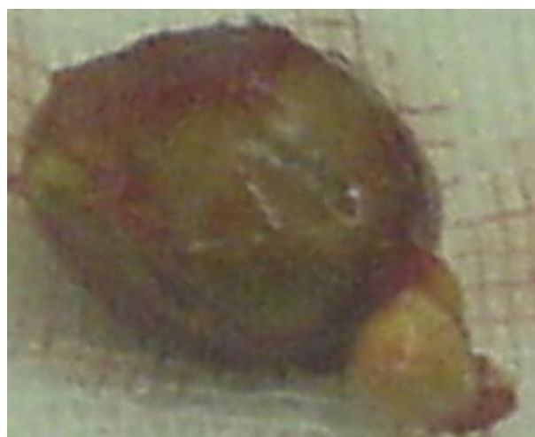
Figure 4. Gross photograph of excised dermoid cyst showing a large cyst and a small cyst attached to it