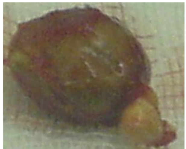
Figure 4. Gross photograph of excised dermoid cyst showing a large cyst and a small cyst attached to it