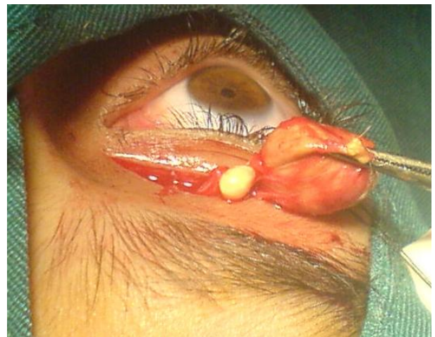
Figure 3. Intraoperative gross pathology of the two discrete cystic mass from the superior oblique muscle