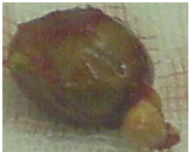
Figure 4. Gross photograph of excised dermoid cyst showing a large cyst and a small cyst attached to it