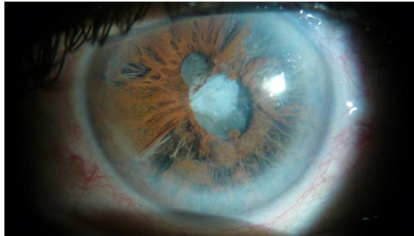
Figure 2. One of the eyes with iridoschisis in which many of the stromal fibers go through a degenerative process in which they detach and free float in the anterior chamber, creating a shredded wheat appearance