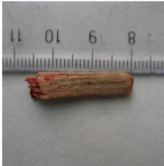
Figure 2. Image of the extracted wood