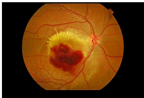
Figure 1. Color fundus photograph of the right eye (OD) 3 weeks after the beginning of visual symptoms. Note the arcuate preretinal hemorrhages in inferotemporal arcade with surrounding hard exudates and severe localized macular edema.

The laboratory examination revealed anti-CMV IgM antibody levels of 57 AU/ml using the electro-chemiluminescence method (normal <30 AU/ml) with low levels of IgG antibody (0.2 IU/ml). The CD4 count was checked and was within normal limits. HIV antibody evaluation tested twice 6 months apart with the ELISA technique was also negative. There was no inflammation or positive findings for progressive retinitis in serial fundoscopy and examination. Four weeks later both IgM and IgG were high; 47.5 AU/ml and 8.3 IU/ml (normal IgG level <0.6 IU/ml). Six months after the first appearance of symptoms, VA increased to 20/40 and retinal hemorrhages and foveal thickness considerably decreased and reached to the near normal value (central foveal thickness reach to 285 \mu ) (Figure 3).