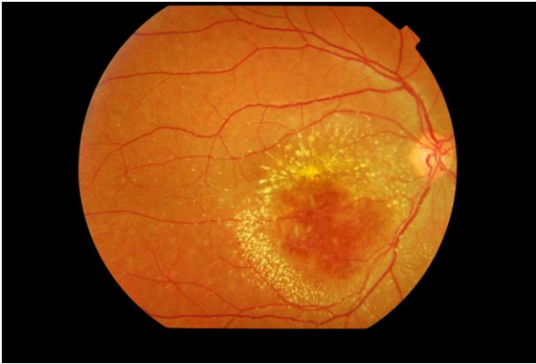
Figure 3. Color fundus photograph of the right eye 6 months after visual symptoms. Note the significant decrease in the preretinal hemorrhages and edema that was associated with improved visual acuity to 20/40 .